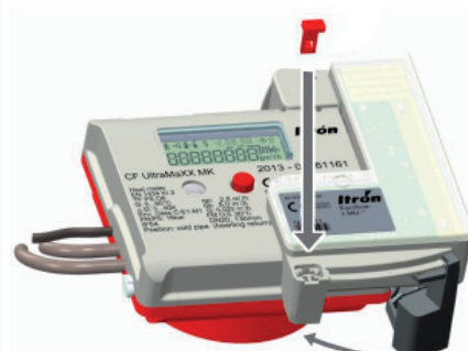
Lock and Seal