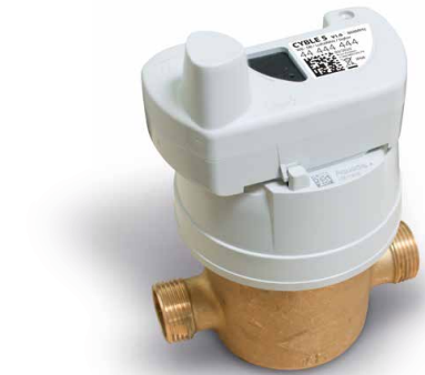
Aquadis+ equipped with the Cyble 5 module