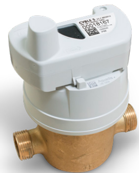
Aquadis+ equipped with the Cyble 5 module