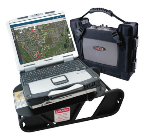
Itron MC3 Radio (actual size: 13" W x 11.25" L x 2.75" H)