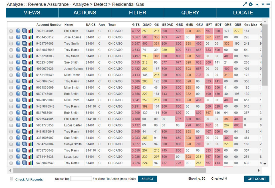
Figure 1: List of accounts with revenue assurance scores indicating loss condition