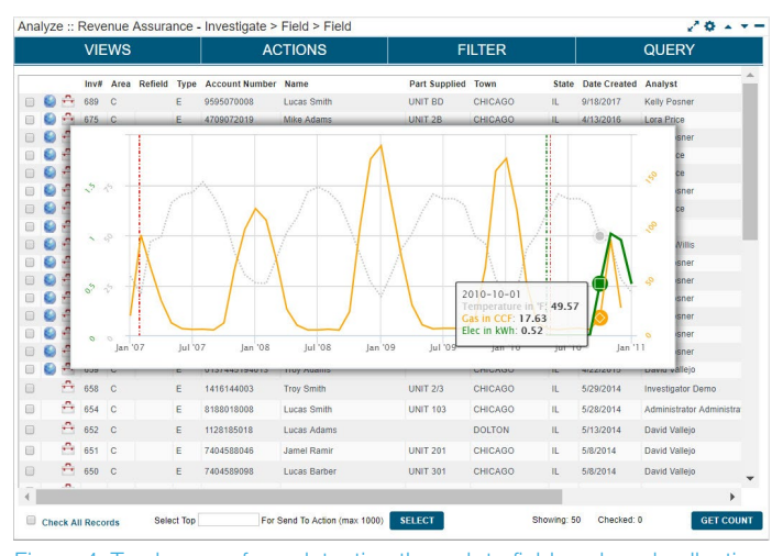
Figure 4: Track cases from detection through to field work and collection